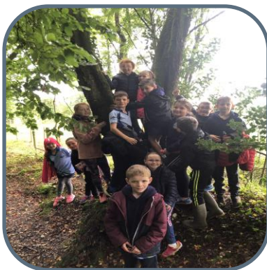
THE WORLD AROUND US